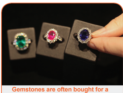
Gemstones are often bought for a pittance and then sold internationally at massively inflated prices

Blood diamonds, also known as conflict diamonds, are diamonds that have been mined in a war zone and are used to fund military operations. There are also concerns that the people who mine the stones are not treated fairly, are working in dangerous conditions, and are not paid a fare wage. In the early part of the 21st century there was a move towards more transparency over the origins of diamonds and the extent to which their sale was funding conflict in Africa (where two thirds of the world's diamonds are mined).