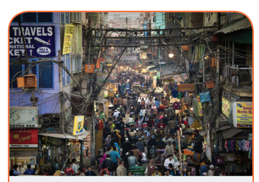
India has the second largest population in the world

One of the major issues facing the world is the number of people alive today. The increased level of development in many countries means that life expectancy is rising, although the number of children that each woman has is decreasing on average. With the birth of the 7 billionth person in October 2011, there was a renewed focus on the sustainability of the current levels of growth. With a world population potentially peaking at around 10 billion around 2050, there is a chance that many of the world's problems will worsen further before they get better.