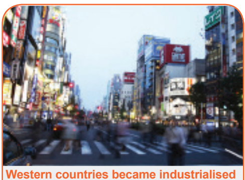
Vestern countries became industrialised towards the end of the 18th century

Demography is the study of populations and the way that they change over time, particularly the statistics of population. Demography studies the balance of males and females, and the proportions of people of different ages. Put simply, population is a straightforward matter of births and deaths, but factors such as the movements of people in and out of countries, which have increased dramatically over recent decades, also need to be considered. The changing trends in population affect everyone, and changes in birth and death rates and overall fertility can have major economic implications.